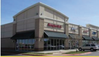
$6M NNN RETAIL CENTER