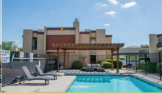
$5M 235-DOOR APARTMENT COMPLEX