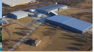
$5M NNN SINGLE-TENANT INDUSTRIAL

Wilson Investment Properties is the premier provider of multifamily and commercial real estate syndications. We have been providing high-quality passive investments for 16 years to investors around the world.